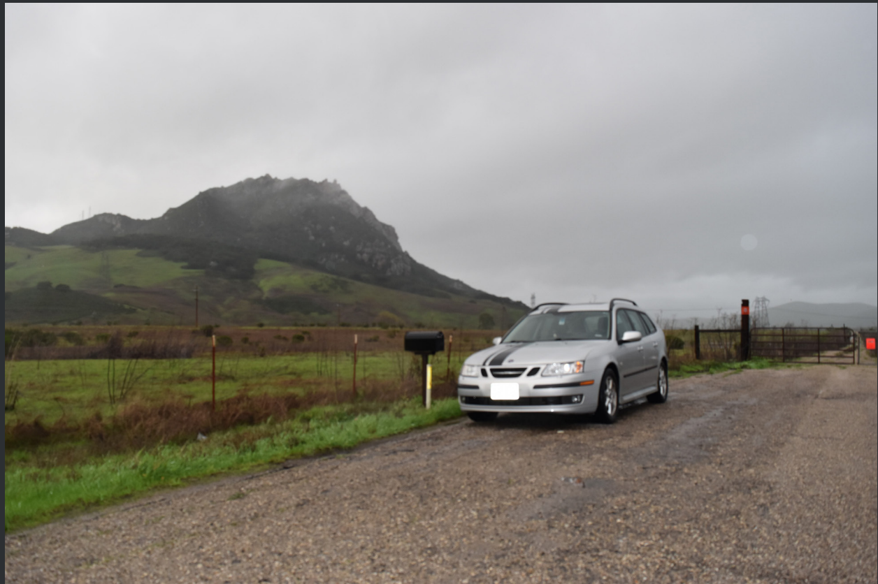
“Grand Day Out”